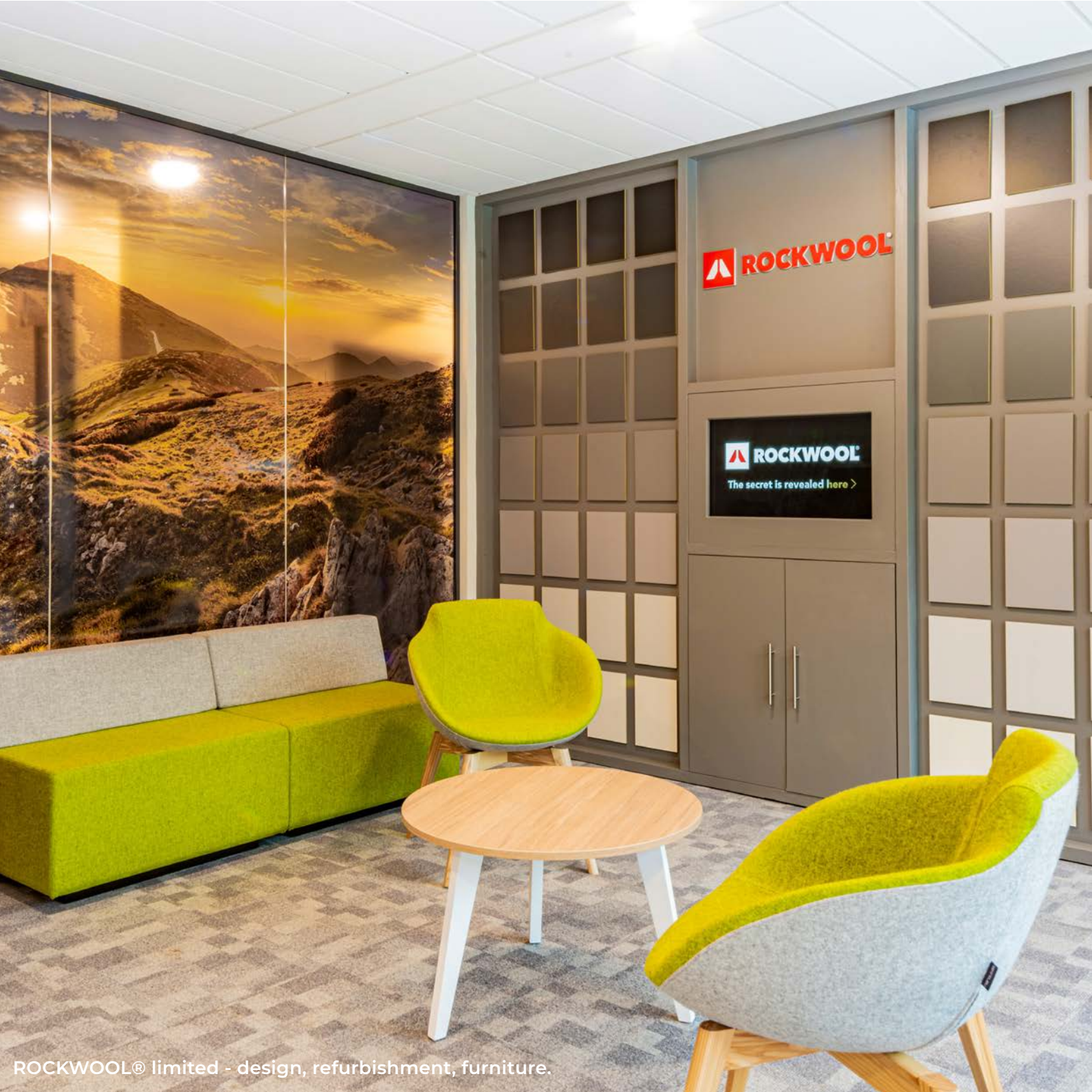
ROCKWOOL® limited - design, refurbishment, furniture.

All works were completed within a fully operational building that needed to be carefully phased and managed throughout.