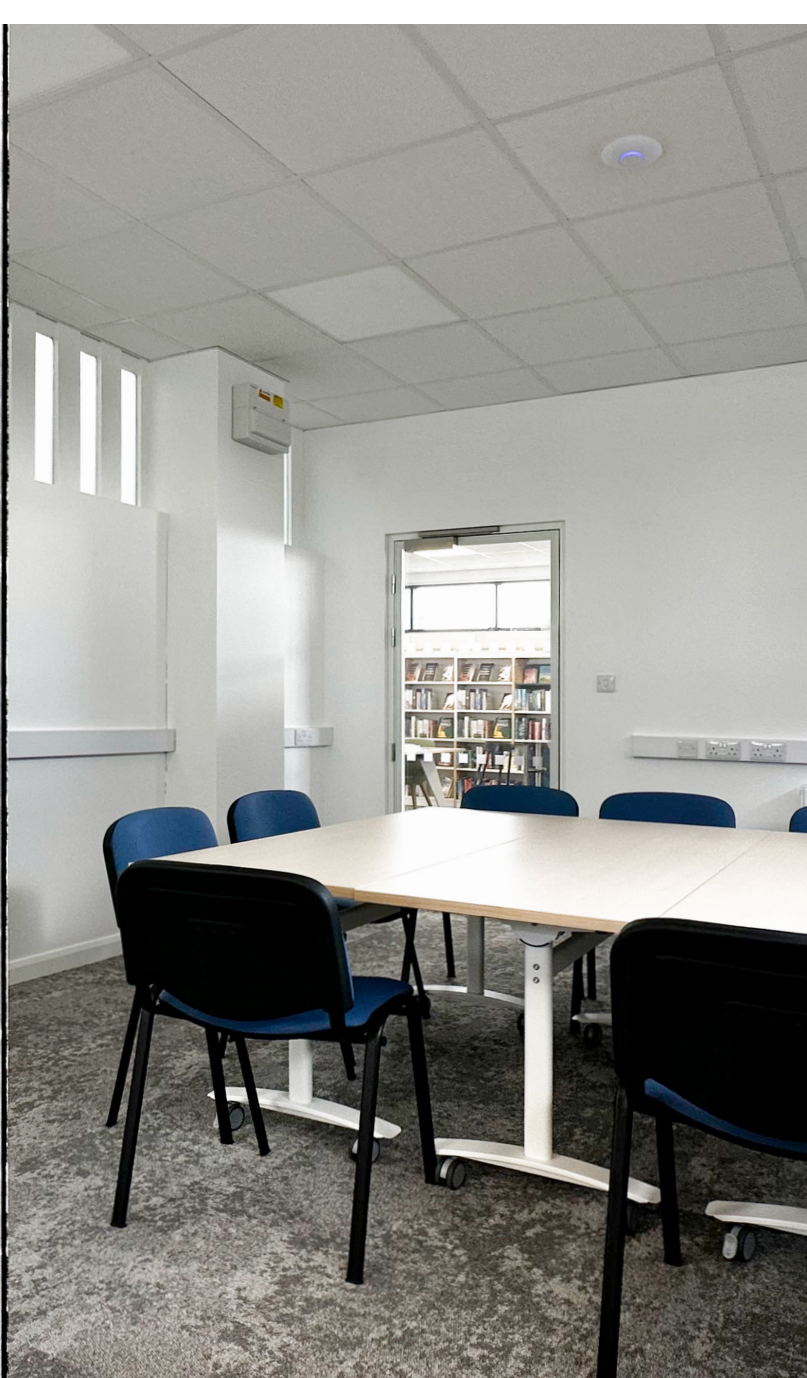
Pencoed Library Case Study Booklet.